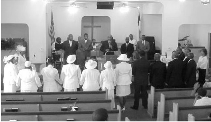
The Deacons and Deaconess gather for prayer during their Anniversary Program.