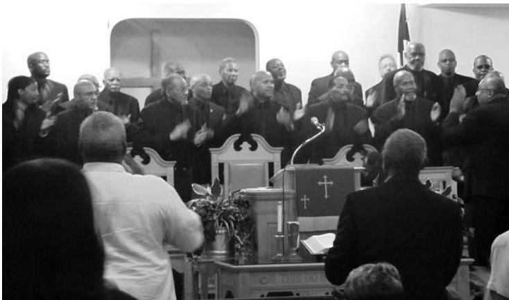
The 100 Men In Black All Male Chorus minister through song during our 2010 Revival.